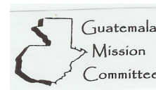
Guatemala Mission Committee

The 50th anniversary of the Spokane Diocese affiliation with Guatemala is this year. There will be an organized trip to Guatemala for interested parties in November of this year. Come to the Guatemala Committee Meeting at 1:00PM on April 19 th in the Gathering Place if you would like information regarding the trip.